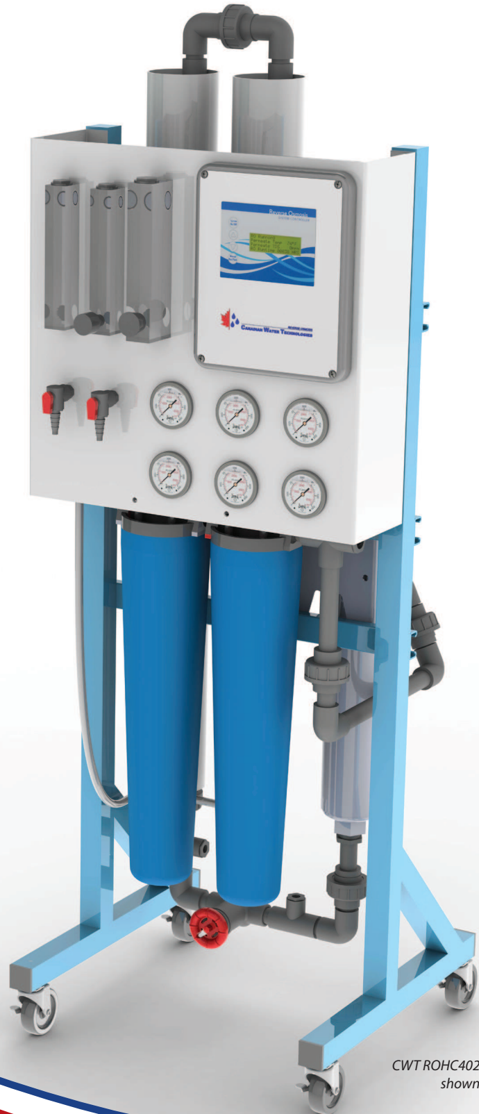
CWT ROHC402 shown